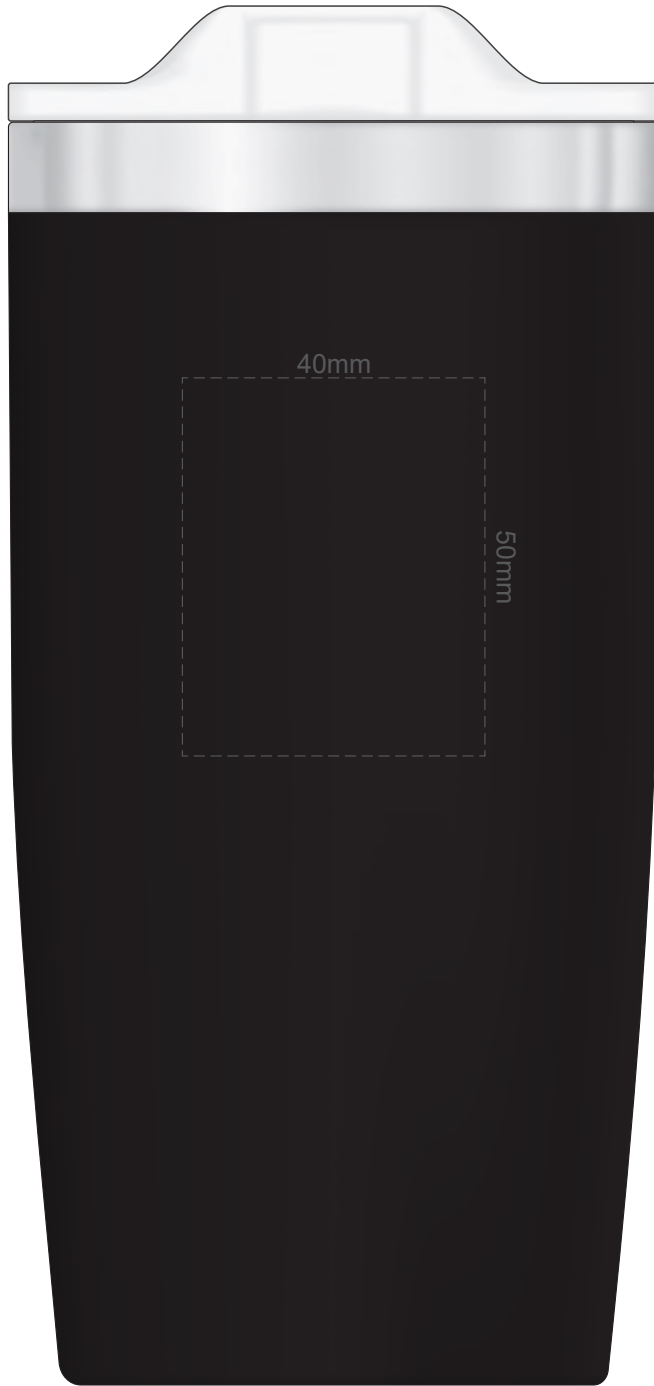
100% of Actual Size Pad Print Front