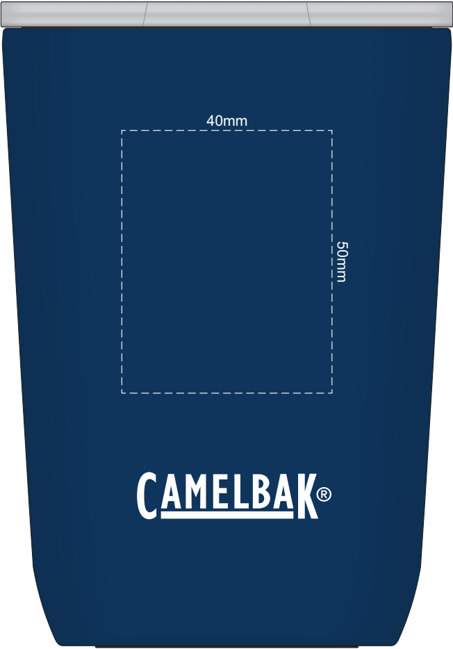
100% of Actual Size Pad Print